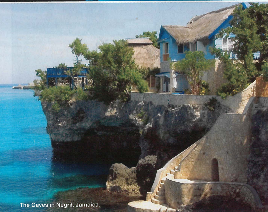
The Caves in Negril, Jamaica.

THE TROPICAL PLEASURES OF THESE CARIBBEAN DREAM DESTINATIONS WILL KEEP YOU ROCKING AND ROLLING FROM SUN UP TO SUN DOWN. BY JILL FERGUS