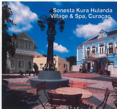
Sonesta Kura Hulanda Village & Spa, Curaçao.

WHERE TO STAY The 83-room Sonesta Kura Hulanda Village & Spa is a high-end boutique hotel housed in beautifully restored 17 th - and 18 th -century Dutch colonial buildings. Combine it with a few days at sister property Kura Hulanda Lodge & Beach Club, set on a secluded cove on the island's westernmost point, for a taste of the island's breathtaking white coral beaches. Room rates start at $289 a night; kurahulanda.com. ■