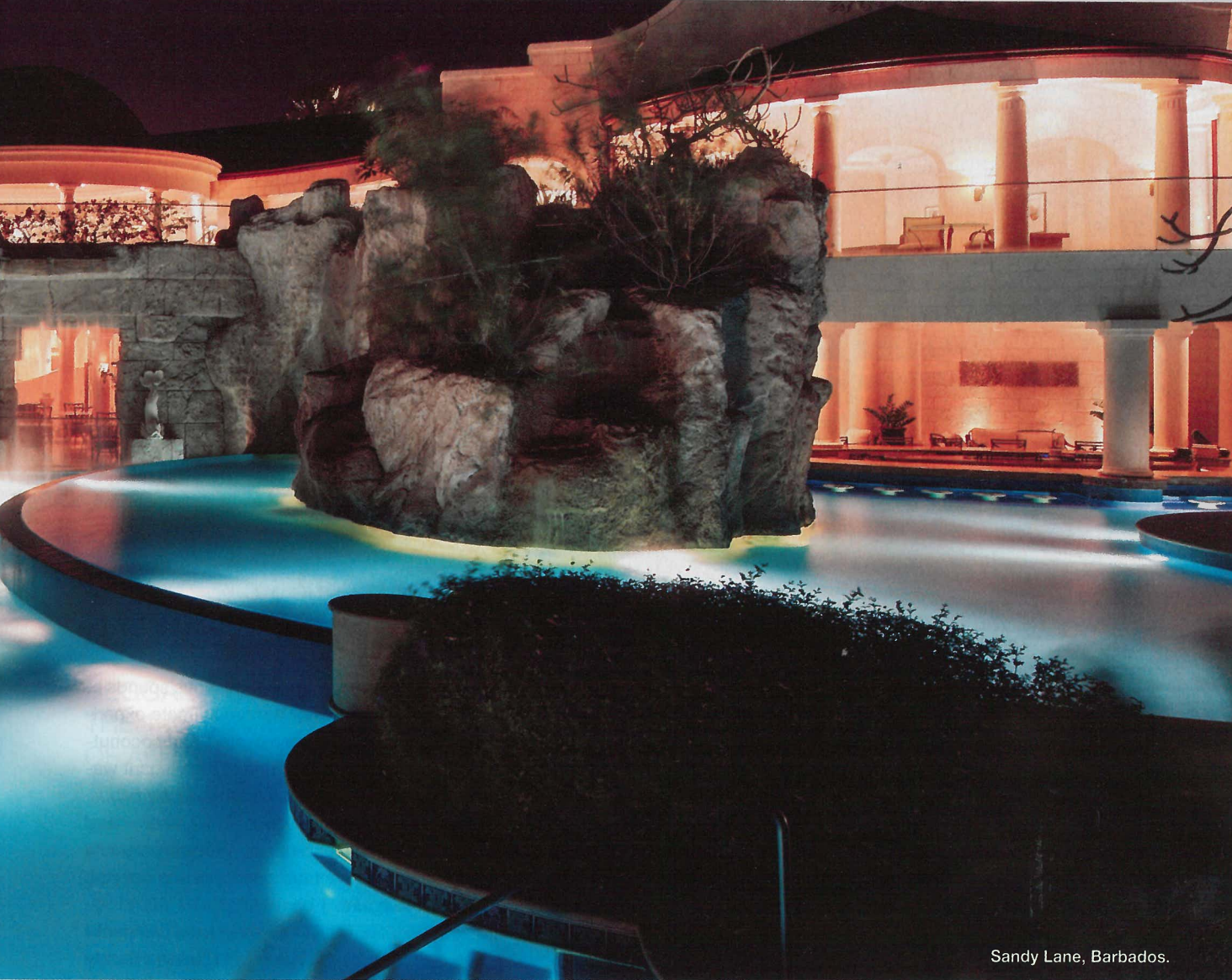
Sandy Lane, Barbados.

romantic resorts. Throw in a few ice cold Red Stripes, and you've got everything you need for a laid-back but thrilling honeymoon.