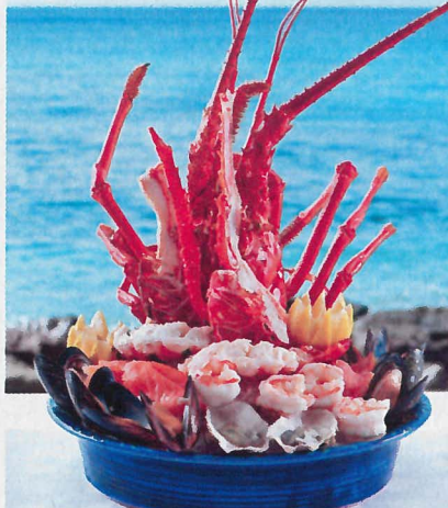
Seafood feast at The Tides Restaurant, Barbados.