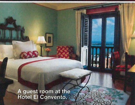
A guest room at the Hotel El Convento.

must). Try your luck in the Condado casinos, and if you still have energy, hit the salsa clubs to try out your dance moves.