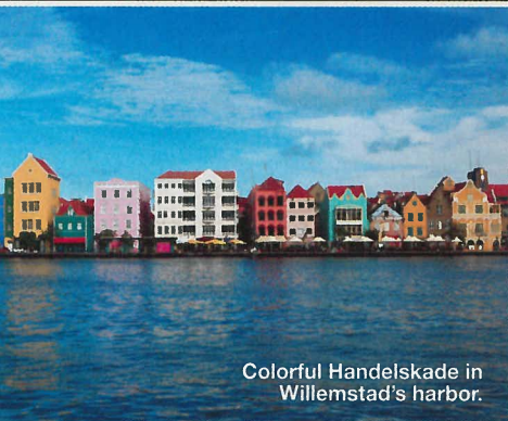
Colorful Handelskade in Willemstad's harbor.