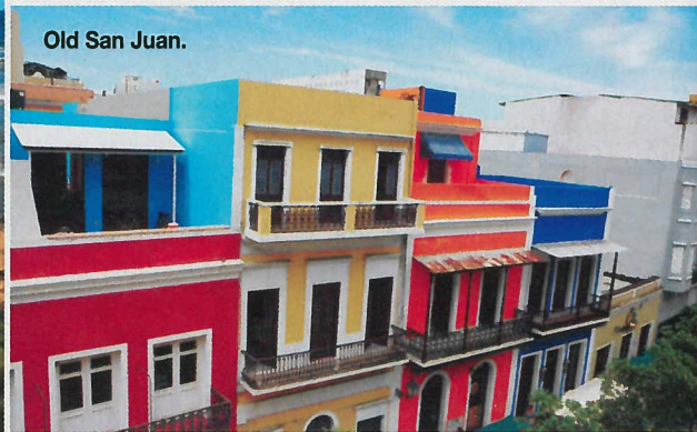
Old San Juan.

CURAÇAO LIQUEUR IS MADE FROM THE DRIED PEEL OF THE LARAHA, A SMALL CITRUS FRUIT GROWN ON THE ISLAND. IT'S COLORLESS, BUT FOOD DYE IS ADDED TO TURN IT A BRILLIANT BLUE IN THE BOTTLE.