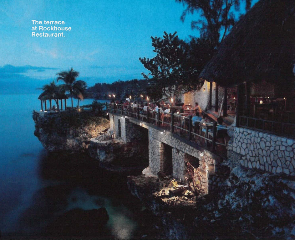
The terrace at Rockhouse Restaurant.

REGGAE MUSIC ORIGINATED IN JAMAICA IN THE 1960s, AND THE BEST-SELLING REGGAE ALBUM OF ALL TIME IS BOB MARLEY'S LEGEND .