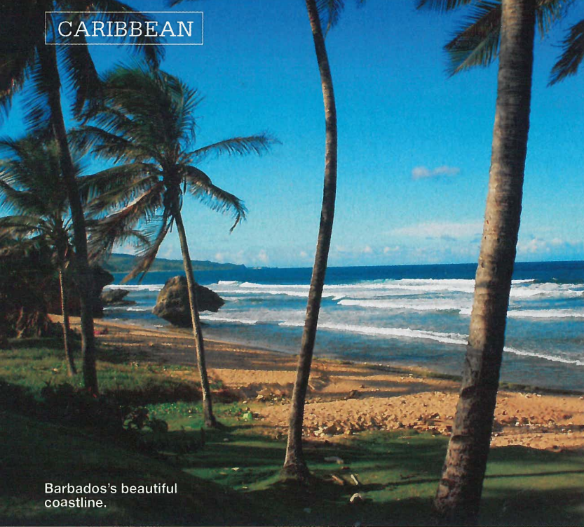
Barbados's beautiful coastline.

CURAÇAO LIQUEUR IS MADE FROM THE DRIED PEEL OF THE LARAHA, A SMALL CITRUS FRUIT GROWN ON THE ISLAND. IT'S COLORLESS, BUT FOOD DYE IS ADDED TO TURN IT A BRILLIANT BLUE IN THE BOTTLE.