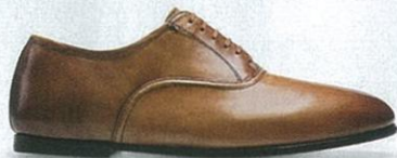
Bally Plas oxford, $995; bally.com.