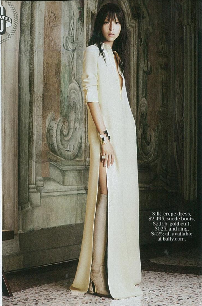
Silk-crepe dress, $2,495; suede boots, $2,195; gold cuff, $625; and ring, $425; all available at bally.com.